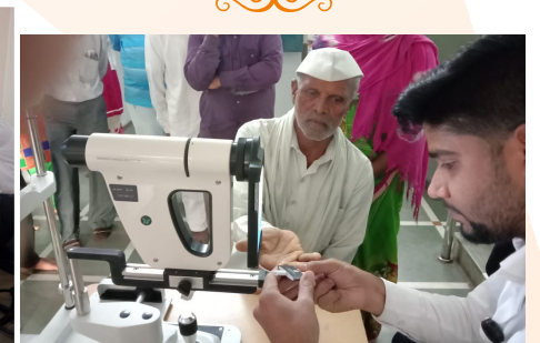
Tejas Eye Hospital-Mandvi, Gujarat