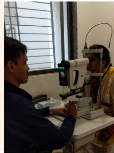
Drushti Netralaya-Dahod, Gujarat