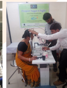
PBMA'S HV Desai Eye Hospital-Pune, Maharashtra