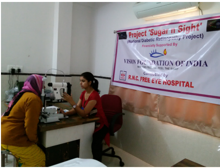
RNC Free Eye Hospital-Valsad, Gujarat