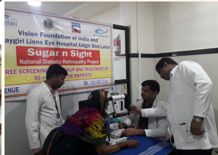
Udaygiri Lions Eye Hospital-Udgir, Maharashtra