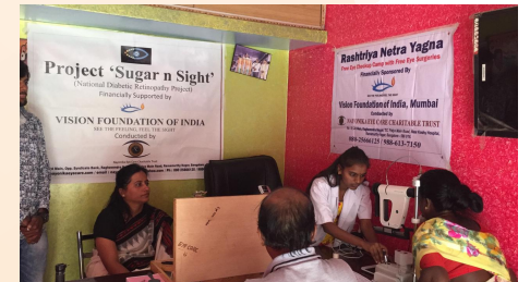
Nayonika Eye Care-Banglore, Karnataka