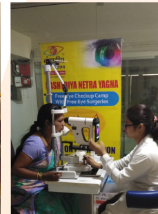
Nandadeep Medical Care Foundation-Sangli, Maharashtra