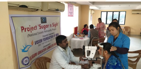
Siliguri Greater Lions Eye Hospital-Siliguri, West Bengal