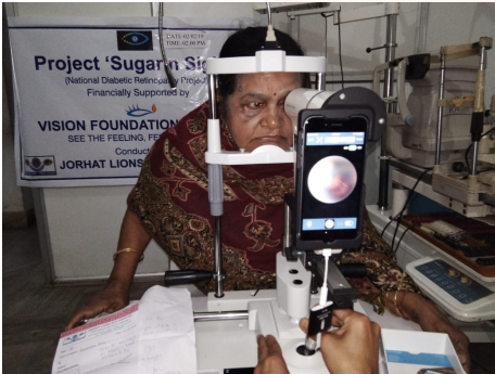
Jorhat Lions Eye Hospital-Jorhat, Assam