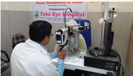
Tulsi Eye Hospital-Nashik, Maharashtra