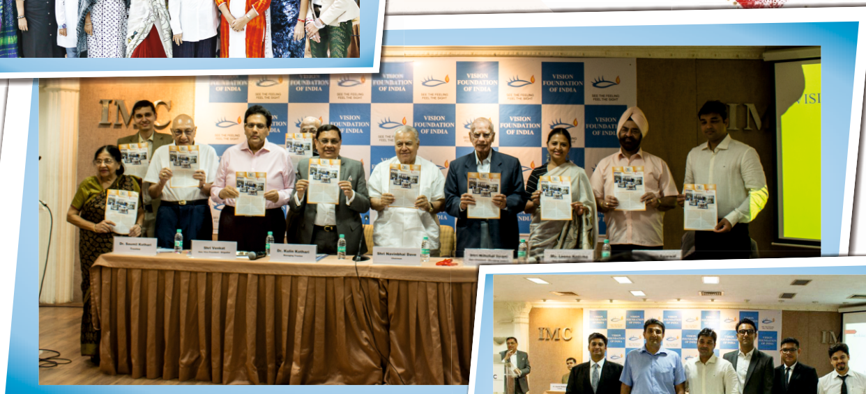
Release of the newsletter Light House (3rd Issue) by dignitaries

Vision Foundation of India wishes you & your family Happy New Year 2018