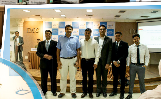
▲ Representatives of the Youth Wing